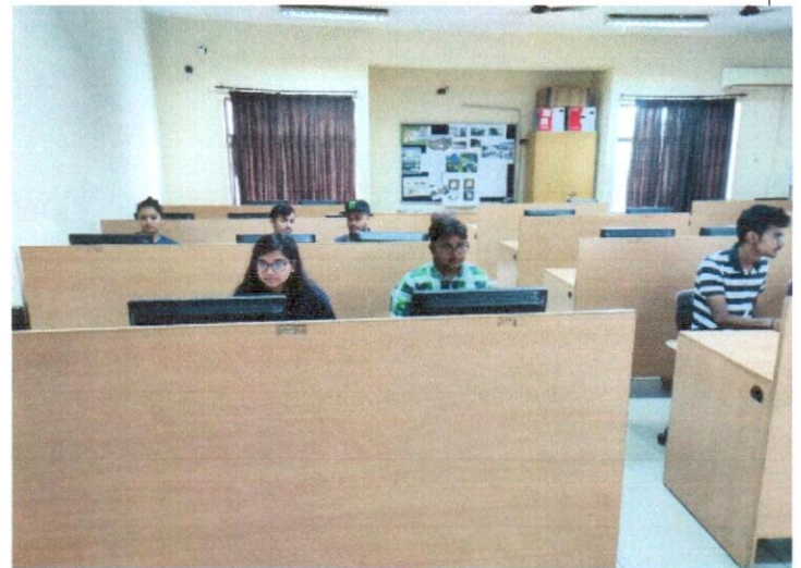
Figure 2 Online Poster making Competition, 10/08/2019