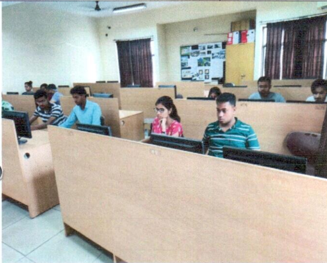
Figure 1 Online Poster making Competition, 10/08/2019